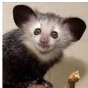
Left: Aye Aye

The woodpecker is part of the woodpecker kind under the bird classification. It is a winged creature with a bill or beak and a variety of colored feathers. To reproduce, the woodpecker lays eggs that hatch when the baby birds are fully developed. The aye-aye is part of the lemur kind, under the mammal classification. It has fur, not feathers, and a mouth with jawbones and teeth. Like most mammals, the lemur carries its babies in its womb and gives birth when they're fully developed. The woodpecker and aye-aye both hunt for insects in wood, but they are two totally different kinds of animals in God's good creation.